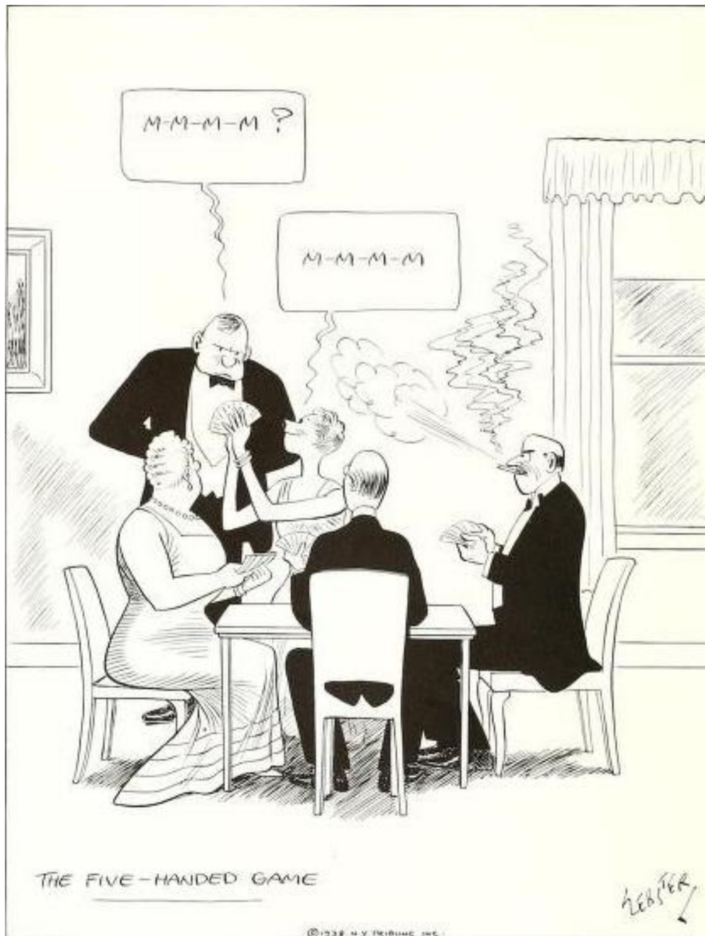
THE FIVE-HANDED GAME